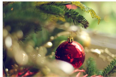
Tis the season to be jolly....

We wish you all a very merry Christmas and best wishes for 2025!