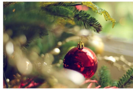
'Tis the season to be jolly....

We enjoyed visits from the fire engine and ambulance and loved meeting the fire fighters and St John's ambulance staff and learning more about their role.