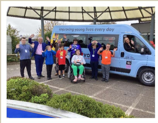
Our new mini-bus – a huge thank you to FOPLSS and the Variety Club!