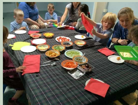
Tis the season to be jolly....