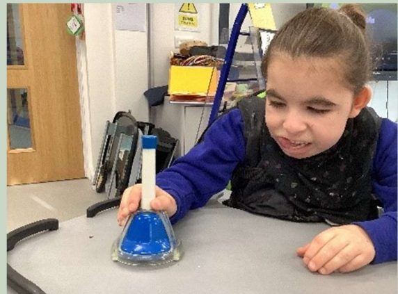
'Tis the season to be jolly....

We have also enjoyed our music sessions in class and we have been part of the new online monthly sessions being run by our local music hub, Love Music Trust. Animal therapy is a big hit for some Barnaby students and they continue to explore the textures of the animals. We've been busy making our own toys in class too, making sensory bottles from all sorts of items that we have chosen and creating Dali inspired pictures using a switch and the hairdryer