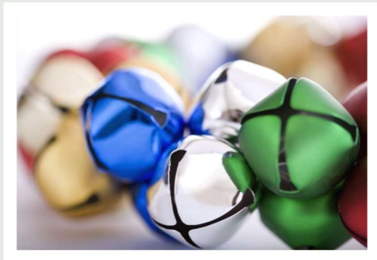
Jingle bells, jingle bells, jingle all the way...

In Autumn term our focus has been 'Superstars'. Our predominant focus this term has been settling into school life, it has been a massive change for the children coming to school each day, meeting new friends and staff that will support them over the upcoming year. We would like to say a huge well done to everyone in Forest for settling down so well and developing new friendships with their peers. We have been using our senses to explore learning, whether this is mark making in sand or shaving foam to morning sensory trays linked to books we are reading or events we are celebrating such as Diwali, Remembrance Day and Bonfire night.