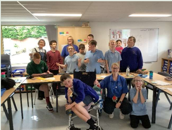
Jingle bells, jingle bells, jingle all the way...

We have had a busy term, learning about number and place value in maths and working as a team, using maths and ICT skills in Enterprise. We have learned about Rosa Parks and enjoyed signing and picture news in literacy. Some of us are doing well with ASDAN communication skills and excelled in a visit to the shops. We have had sessions with Sale Sharks for tag rugby, enjoyed swimming at Macclesfield Leisure Centre and developed skills in handball. We have prepared snacks and baked gingerbread in cooking, enjoyed Happy Minds and used our Zones of Regulation. We have learned about forces in Challenge and the Fire of London in Community.